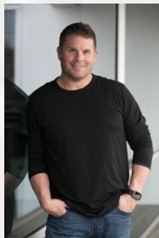
Rod Roddenberry.

The Flight Test Museum Foundation , which is a nonprofit, is building a one-of-a-kind museum, dedicated to test pilots and experimental air - and spacecraft. To help spread awareness and source funds, they are inviting the public to its annual "Gathering of Eagles" fundraiser which recognizes exemplary aviators. This will include two NASA astronauts.