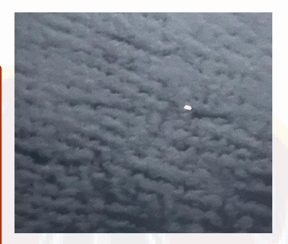
Photo of the ISS passing over Jekyll Island. Traveling at 17,500 mph. I tracked the ISS with an app. Submitted by Cindy