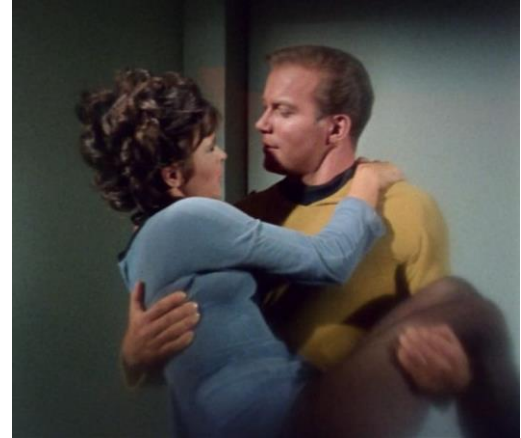
Dagger of the Mind – Remembering the Enterprise Christmas Party

Honorable Mention: Xmas Story ( Futurama Spoiler alert: Tiny Tim lives. ) There are enough Trek jokes in Futurama to make any fan happy, so the episode Xmas Story , where the crew of Planet Express fight Robot Santa, is definitely a "must see."