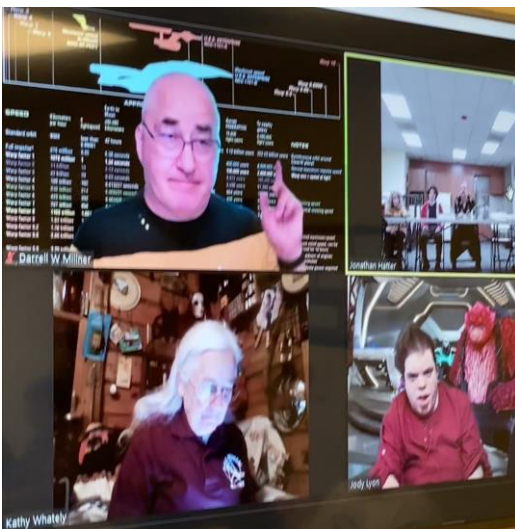
Our ZOOMIES enjoying the meeting