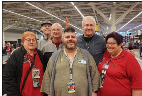
The Crew of the USS Renegade with Brent Spinner at Fan Expo Con in Cleveland, Ohio.